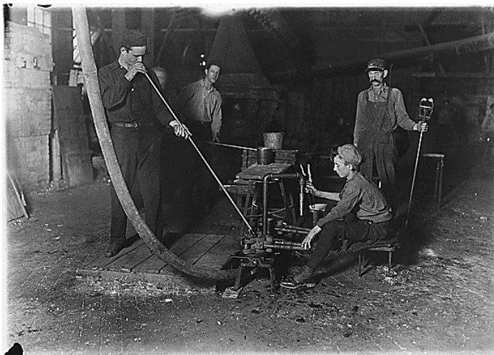
Glass Blower and Mold Boy, Grafton, WV October 1908